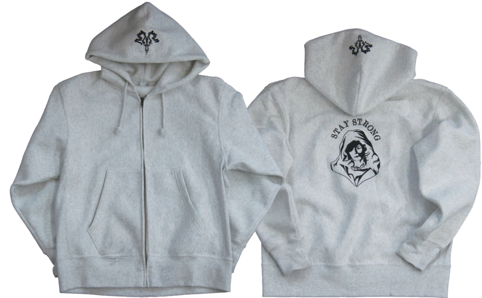
Balance hoodie 100% Cotton Size M AH 90% Cotton. 10% Polyester ¥ 7,500 HC 50% Cotton. 50% Polyester Color White