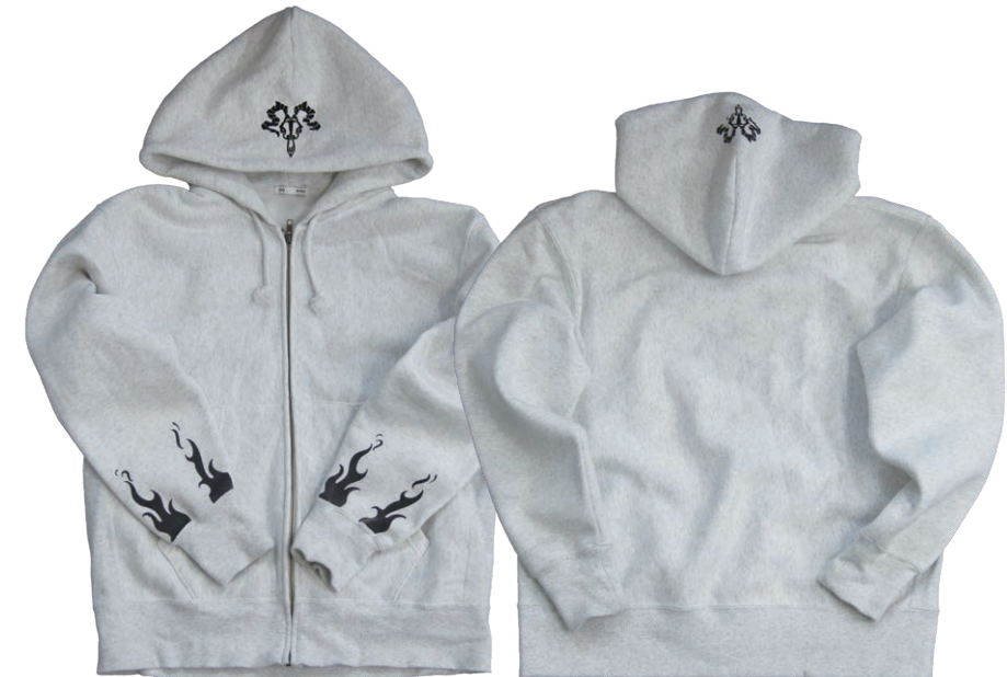
Balance hoodie 100% Cotton Size M AH 90% Cotton. 10% Polyester ¥ 7,500 HC 50% Cotton. 50% Polyester Color White