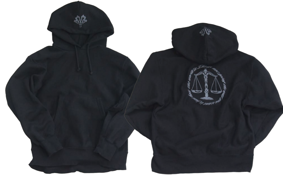
Balance hoodie 100% Cotton Size M AH 90% Cotton. 10% Polyester ¥ 7,500 HC 50% Cotton. 50% Polyester Color Black