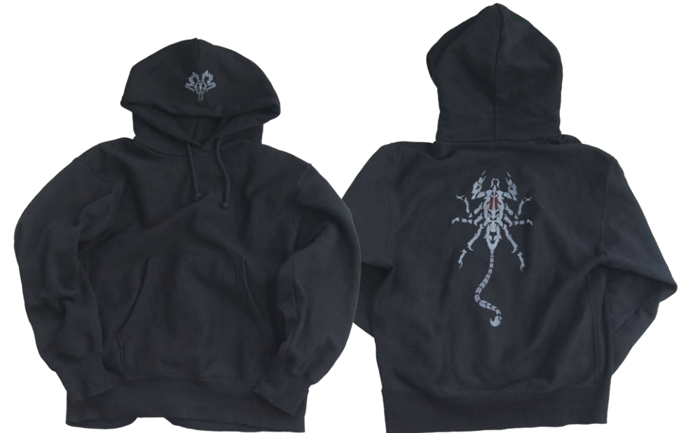
Balance hoodie 100% Cotton Size M AH 90% Cotton. 10% Polyester ¥ 7,500 HC 50% Cotton. 50% Polyester Color Black